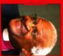
Archbishop Desmond Tutu

"African people have great skills, initiative and energy. They work so hard to develop their communities and their continent, against such heavy odds. But you cannot work with bare hands."